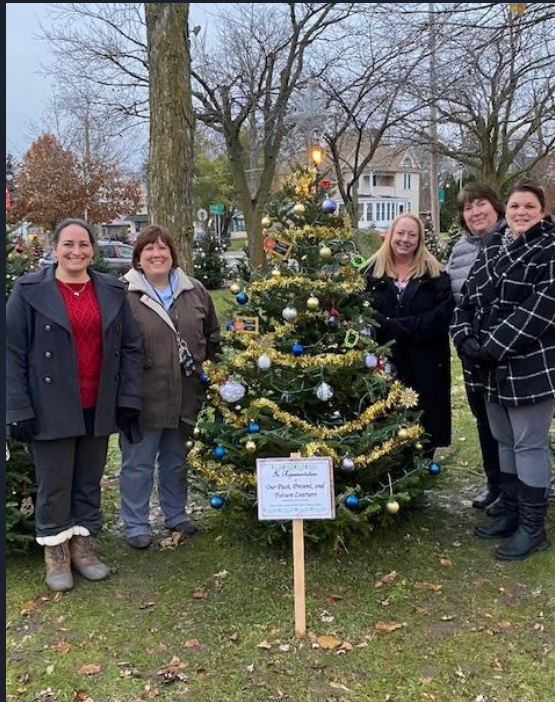
Decorating the OATA tree at Triangle Park!