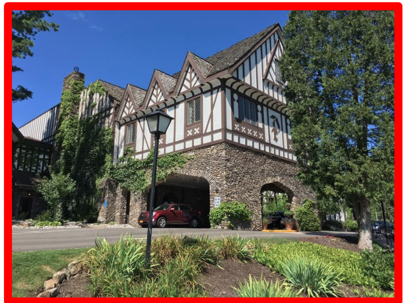
NYSUT Convention in August at Peek n' Peak. Tons of great information!