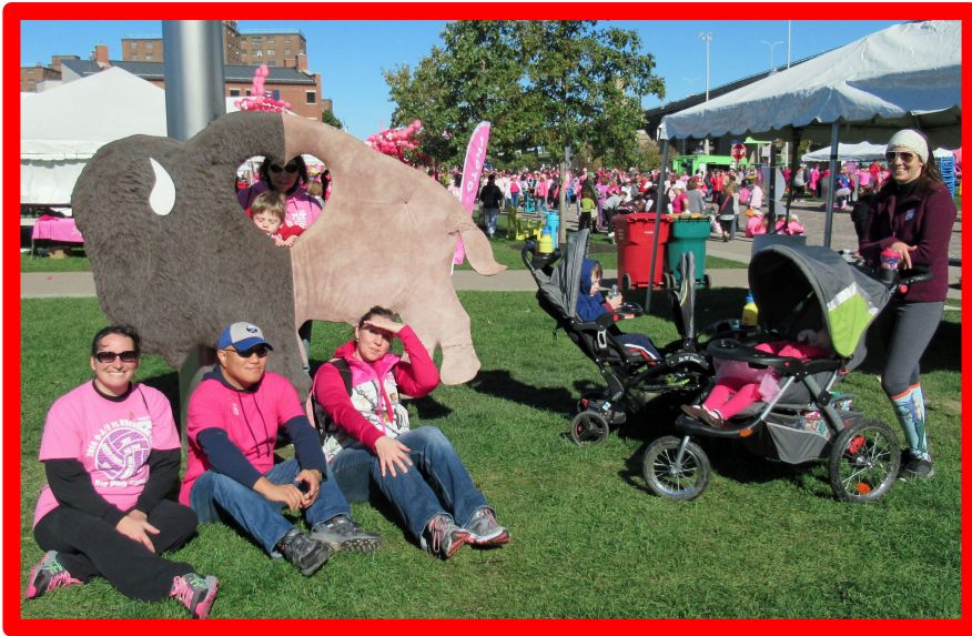
Making Strides Breast Cancer Walk on October 15th at Canalside in Buffalo, NY.